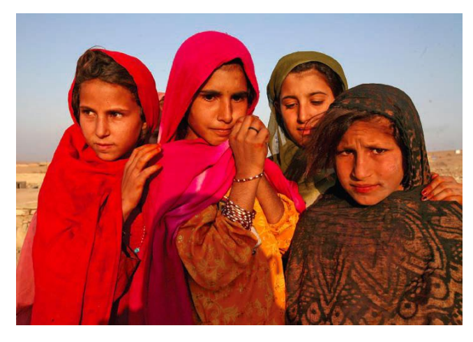
UNHCR / 2008

Internally displaced women are at a heightened risk for sexual and gender-based violence and have specific health needs that often go unmet. In displacement, they may find themselves without the protection they would normally have from their families and communities. Children in particular may be separated from family members and caretakers, putting them at increased risk for sexual abuse, exploitation and recruitment into armed groups. Even though much remains to be done, there has been progress on some key protection issues. The greatest